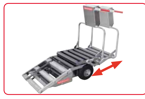
Foldable loading table for working in confined spaces. The user takes the vehicle in retracted state to the animal. The loading table unfolds while pulling the animal onto the vehicle.